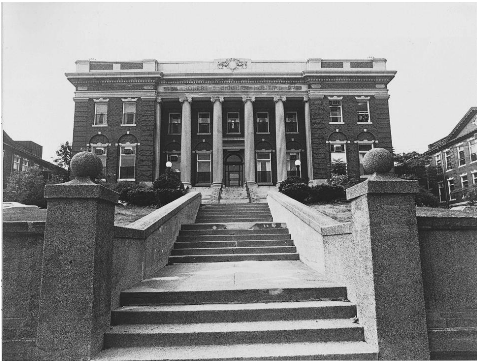
Robert Breck Brigham Hospital (1914)