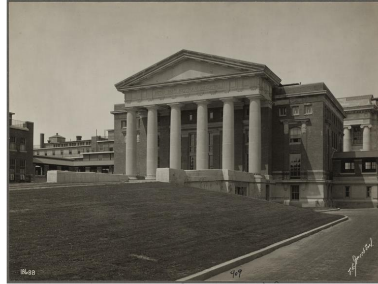
Peter Bent Brigham Hospital (1913)