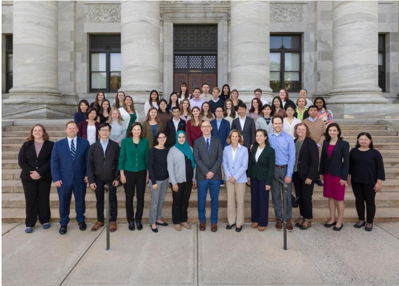
Section of Clinical Sciences (SCS)